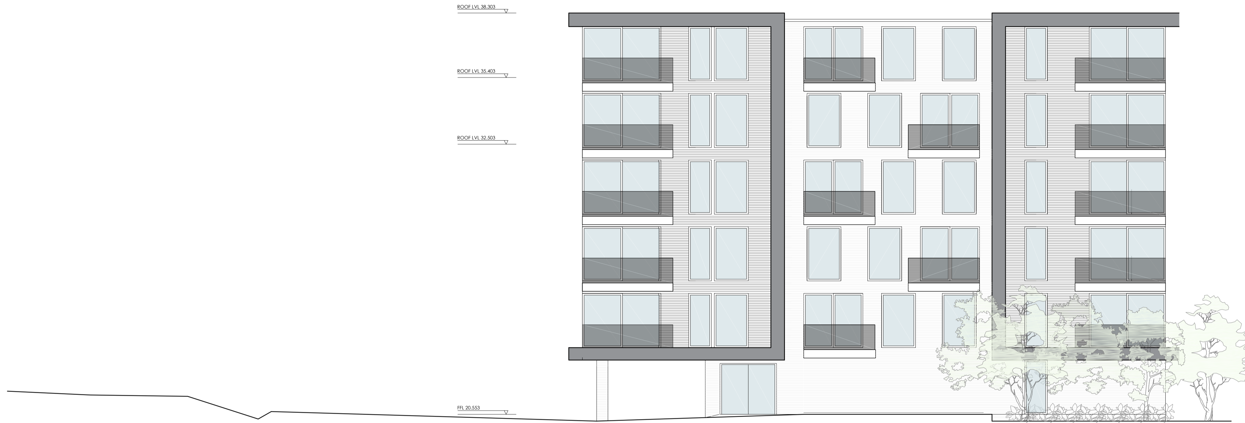
1 PROPOSED REAR/EAST ELEVATION P612 scale 1:100

THE CONTRACTOR IS RESPONSIBLE THAT ALL WORK AND MATERIALS ARE TO BE IN ACCORDANCE WITH THE BUILDING REGULATIONS AND TO COMPLY WITH THE RELEVANT CODES OF PRACTICE AND BRITISH STANDARDS